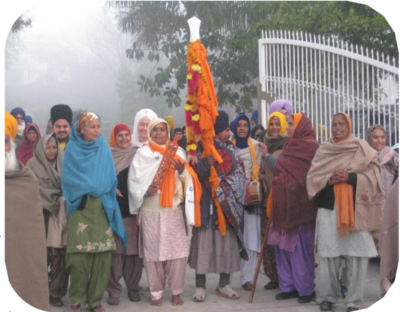
Ladies Celebration in Anandpur Sahib